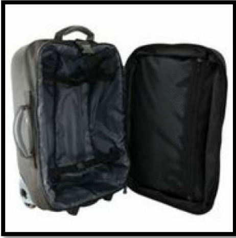
LITEGEAR 20" HYBRID CARRY-ON