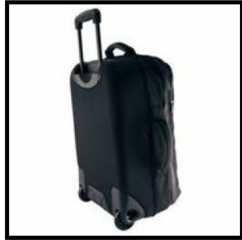
LITEGEAR 20" HYBRID CARRY-ON

The interior of LightGear's 20" Hybrid carry-on also offers the convenience perks you find with the bigger guys – two internal compression straps help keep the contents in place, while a large internal mesh pocket helps you organize them. Plus an adjustable piggy-back strap allows you to strap your carry-on onto a larger piece of luggage and move independently around the airport. Again, well-designed.