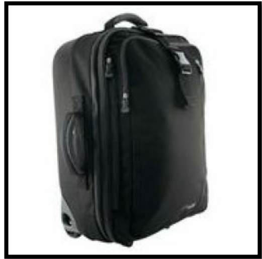
LITEGEAR 20" HYBRID CARRY-ON

The "solution" was a 20" Hybrid carry-on from LiteGear, a company that launched in April of 2014. Thanks to LiteGear's innovative design team, the LiteGear 20" Hybrid carry-on suitcase is not only durable and extremely light, but also offers optimum versatility and usage of space. Plus, it's affordably priced.